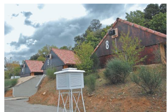
Example of Actis "in-situ" test cells, Limoux, France.

When laying Actis insulation materials outside, remember that multifoil insulation is highly reflective. Where the product is being installed in bright or sunny weather conditions, appropriate eyewear should be worn (such as sunglasses conforming to the most stringent requirements of BS EN 172, as amended from time to time) and protect against sunburn.