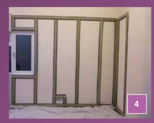
Fix battens around all wall edges, openings and services. Come round the internal wall a minimum of 400mm.