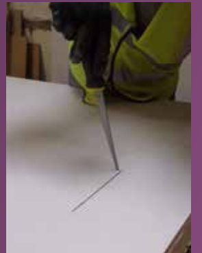
For sockets, measure and cut For external corners, the hole for the socket using