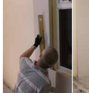
Tap the board into position using a straight edge and check level. Come around the internal wall a minimum of 400mm. Board joints must be staggered (break bonded).

Place Eco-Liner into position. Ensure adjoining boards are tightly butted.