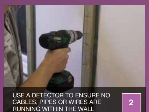
Fix vertical battens to the wall at a maximum of 600mm centres. Hold timber in place, drill through the timber into the wall and secure in place using wood screws and wall plugs or nailable plugs (see fixings). Timbers can be packed out to ensure a level surface. Horizontal battens should be installed at the top and bottom of the wall.