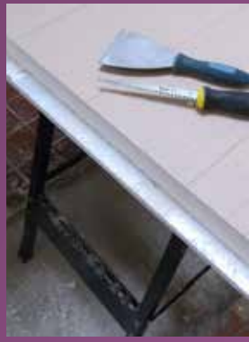
channel out the insulation to accommodate the adjoining board. For internal corners channelling is not required, of insulation.