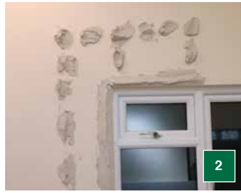
Trowel a continuous ribbon of adhesive around all wall edges, openings and service penetrations.