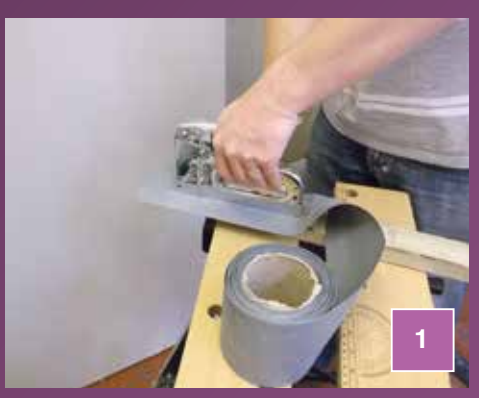
25 x 50mm treated timber battens should be used to install Eco-Liner. 100mm DPC strips should be cut and stapled to the back of the battens prior to fixing to the wall. Mark the walls to indicate the position of the battens.

Suitable for: Stone, random rubble, brick, block or concrete solid walls or cavity walls with any friable material removed