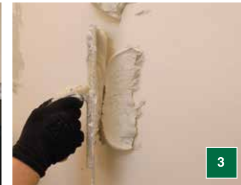
Adhesive dab sizes should be 10-25mm thick, 50-75mm wide and 250mm long. At least 18 dabs per board are required, typically at 600mm centres – no less than 20% contact.