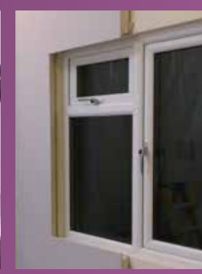
Board joints should be as installing around a window