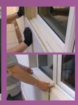
37.5mm Eco-Liner board and apply drywall adhesive to the