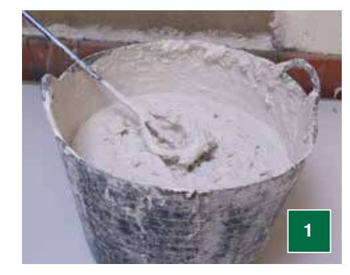
\label{eq:mix} \mbox{Mix up drywall adhesive as per manufacturer guidelines.}

Suitable for: Brick, block or concrete solid walls or cavity walls with any friable material removed