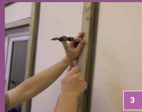
Fixings should penetrate a minimum of 45mm into the existing solid masonry and fixings should be no more than 600mm apart and 75mm in from the end of each timber batten.