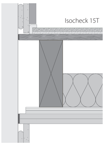
Flanking Strip turned back under skirting and trimmed flush with a sharp knife.

☐ Isocheck 28T, 24T, 18T or 15T must be kept in a dry storage area. Deliveries should be scheduled to coincide with availability of suitable dry storage areas.