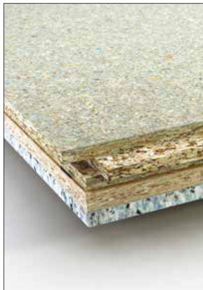
Karma Visco 400

All products are supplied factory bonded.