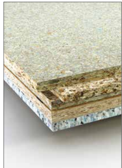
Karma Visco 600